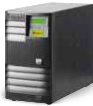
Megaline - Megaline Rack

The range is wide and complete, with solutions that guarantee maximum performance in terms of power and backup time.