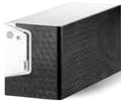
Keor SP from 600 VA to 2 kVA