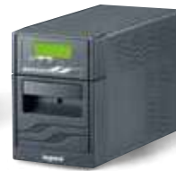
Niky S from 1 to 3 kVA