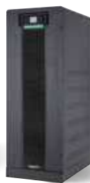
Keor T Evo