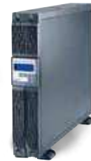
Daker DK Plus