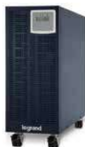
Keor S from 3 to 10 kVA

Compact, robust and easy to move, Keor S is the perfect UPS to protect and supply loads in the industrial fields. Two different models are available as internal configuration; internal battery only or input isolation transformer with internal battery. Protection Degree IP31