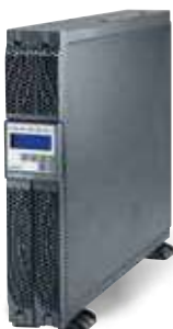
Daker DK Plus from 1 to 10 kVA

With the reversible screen, the Daker DK Plus UPS can be used in both tower and 19" rack configuration.