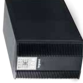
Keor LP from 1 to 3 kVA