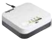
Keor DC 25 W