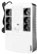
Keor Multiplug from 600 to 800 VA